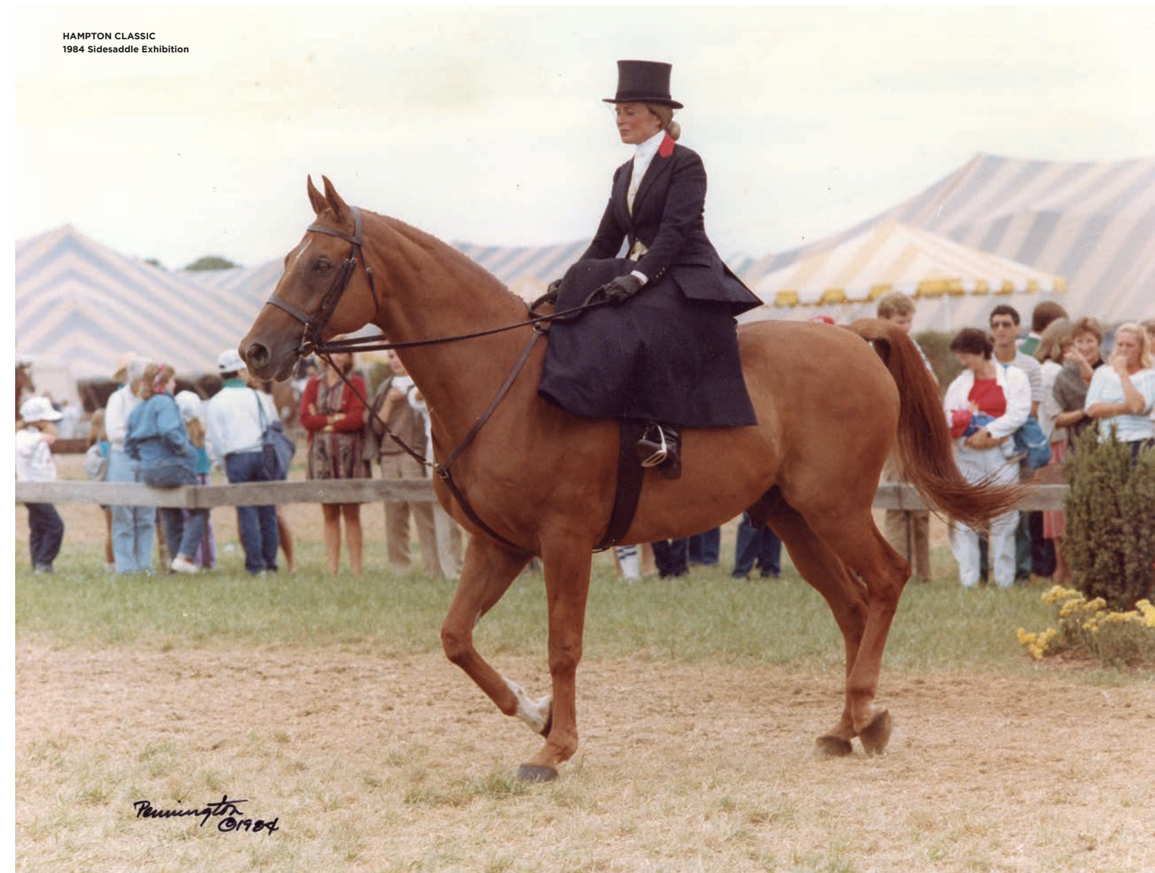
HAMPTON CLASSIC 1984 Sidesaddle Exhibition