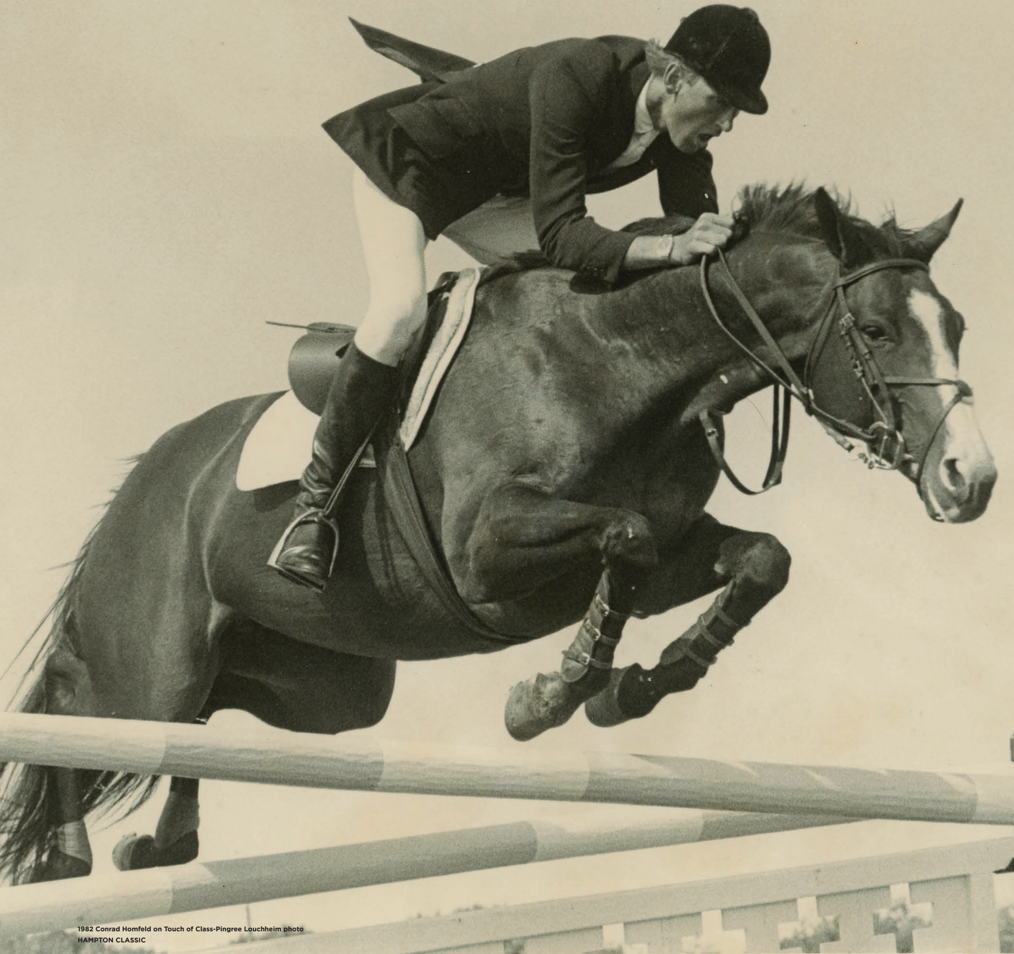
1982 Conrad Homfeld on Touch of Class-Pingree Louchheim photo HAMPTON CLASSIC