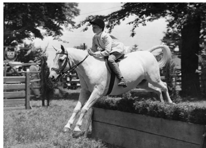
UPPERVILLE COLT & HORSE SHOW COLLECTION

IN RECOGNITION OF THE SHOW'S CONTINUED EVOLUTION INTO A HIGH-QUALITY EQUESTRIAN EVENT, IT HAS BEEN AWARDED USEF PREMIER AA AND FEI CSI4* DESIGNATION, SHOWCASING THE SPORT OF SHOW JUMPING AT THE TOP LEVEL WHILE CONTINUING TO STAY TRUE TO ITS ROOTS.